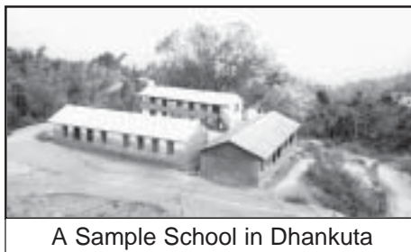
A Sample School in Dhankuta

of grade 1 which, in turn, not only leads to improvement in the internal efficiency scenario of the primary education system but also improves effective learning of the smaller children.