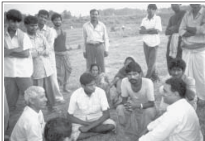
Researcher doing FGD in one of Tarai Districts

To make EIP effective extensive awareness-raising activities are required at the district and local levels regarding the SFG and the roles of IMC and local NGOs /Clubs.