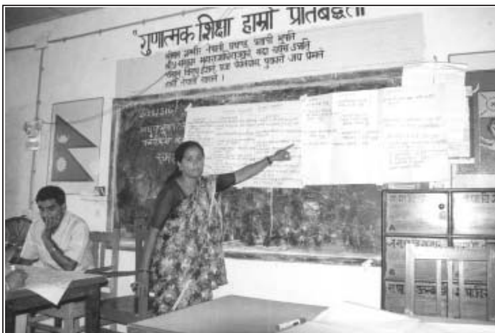
A participant presenting after a group work session on Key Research Questions at Geta, Dhagadhi

FRP has conducted one resource centre based workshop in each of the five development regions on key research questions. The purpose was to identify key research questions pertaining to BPEP II at the grassroots level. The workshops were organized in Ilam, Kavrepalanchowk, Syangja, Banke, and Kailali districts. In addition, a one day session with the DOES of the Eastern Development Region in Biratnagar was also utilized for this purpose of identifying key research questions.. Findings from those six workshops were discussed at a meeting held in the Department of Education with chiefs of all the units in the DOE, and a list of relevant key research questions was developed. A final meeting in this respect was conveyed at CERID and a list of key research questions that need to be addressed by FRP