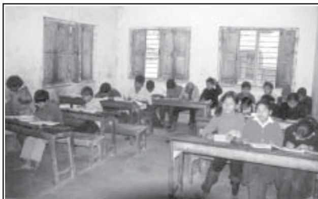
A sample Classroom

Keeping in view the possibility of various social, cultural and religious factors hindering the participation of hardcore group in education and other measures to address their needs should be identified. Monetary incentive alone doesn't seem to be enough.