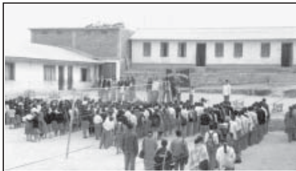
Morning Prayer in one of Sample schools.

T o minimize the error and improve the quality and accuracy of data it is important to simplify the school information form and add clear guidelines (such as definition of drop-out and process of its computation) to it. Providing hands-on experiences to data managers at school level in calculating indicators and filling up the school information form will certainly help in improving the data quality.