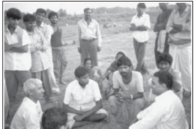
Researcher doing FGD in one of Tarai Districts

To make EIP effective extensive awareness-raising activities are required at the district and local levels regarding the SFG and the roles of IMC and local NGOs /Clubs.