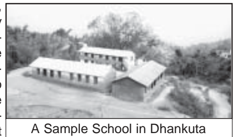
A Sample School in Dhankuta

of grade 1 which, in turn, not only leads to improvement in the internal efficiency scenario of the primary education system but also improves effective learning of the smaller children.