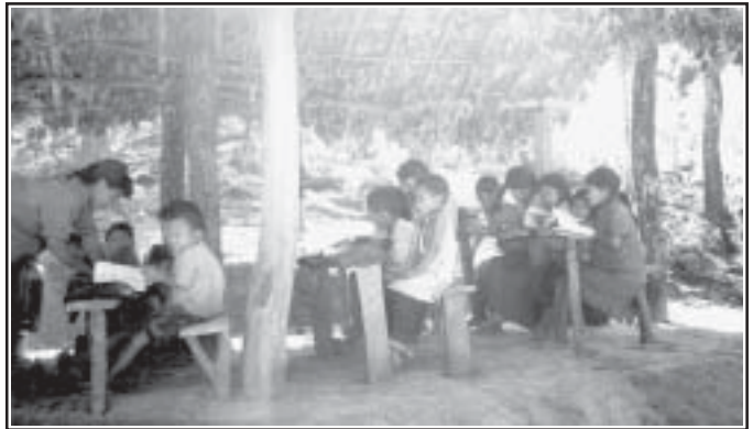
A typical Classroom in Chitwan

T his study has explored the range, magnitude and causes of errors in school-reported data, identified